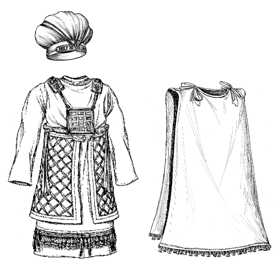
High Priests Garments